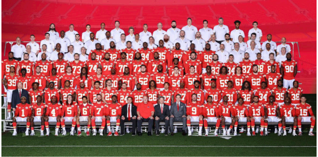
2023-2024 Kansas City Chiefs Official Team Photo