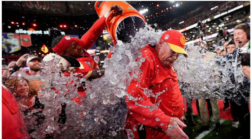
Andy Reid is splashed by players after the game.

The win cements the Chiefs' legacy as the NFL's next great dynasty, becoming the first back-to-back NFL champions in 19 years and winning its third ring under head coach Andy Reid and with Mahomes as quarterback.