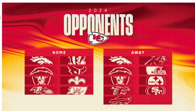
Kansas City Chiefs Opponent Release Via Instagram

Additionally, an explanation of how these opponents were determined is below.