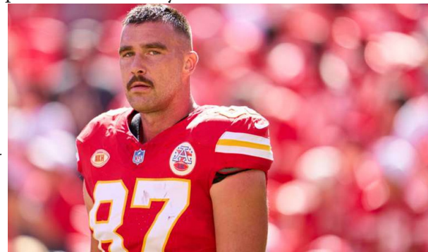
Travis Kelce before Sep. 24 game

The new contract caps a monumental year for Kelce, which included his third career Super Bowl win in February, his ninth career Pro-Bowl nod, and the start of a high-profile romantic relationship with music superstar Taylor Swift.