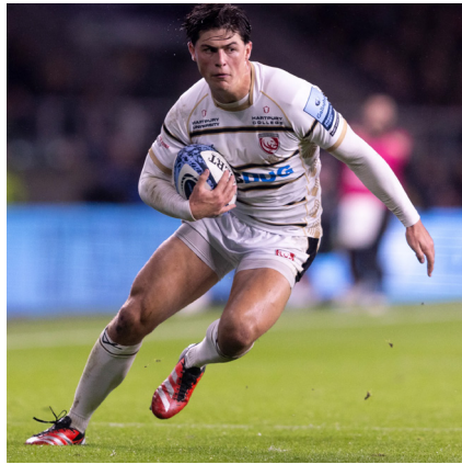
Louis Rees-Zammit during a rugby match

By signing with Kansas City, Rees-Zammit has already joined 37 past players from the program in signing a contract. His next goal will be to join the five who have made an active roster -- fellow rugby player and Eagles offensive tackle Jordan As part of a new rule in 2024, NFL clubs can use a 17th roster spot on their practice squads exclusively reserved for an international player. That player can be elevated to the active roster up to three times during the season.