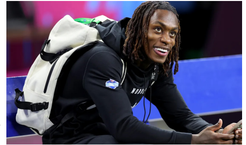
UT Austin WR Xavier Worthy at the NFL Draft Combine

The speedy Worthy led the FBS in return yards last season with 371, which included a 74-yard touchdown. He averaged 13.8 yards-per-return over the course of his career at Texas, handling 41 punts for 564 yards and a score.