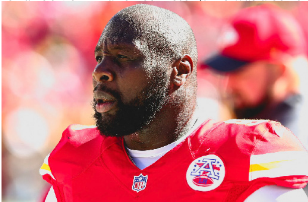
Tamba Hali before a Chiefs game

He stands as one of the most prolific pass rushers in Chiefs history. His 89.5 sacks for -591.5 yards are both second only to PFHOF LB Derrick Thomas in Chiefs history. The total includes 8.0 sacks his rookie season, the third most for a rookie in franchise history. He was also relentless when it came to punching the ball out of the opponent's grasp.