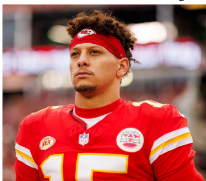
Patrick Mahomes before a Chiefs games

The full list will be revealed in the days to come.